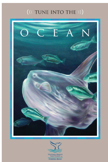
Artwork: Chlo Viret

The sanctuary research team used new maps of Cordell Bank in conjunction with submersible observations to identify habitat types on the Bank where cold-water corals are found. Corals, which are slow-growing and sensitive to disturbance from activities such as bottom-tending fishing, provide crucial habitat for fish and invertebrates on the Bank and indicate areas of high biodiversity. The relationships between habitat types and coral presence were used to create predictive maps of the most sensitive and biologically diverse regions of the Bank. Understanding fine-scale patterns of corals provides a framework for monitoring these sensitive species and associated communities, particularly in the presence of changing ocean conditions. This knowledge of cold-water coral communities highlights the need for continued protection for these fragile seafloor communities. Detailed maps of Cordell Bank, which were generated using multibeam technology through a partnership with the California State University Monterey Bay Seafloor Mapping Lab, provide critical baseline data and have been useful for a variety of resource protection and research activities within the sanctuary.